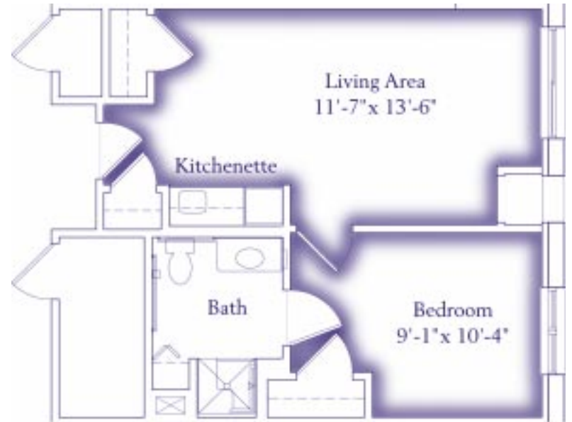
One Bedroom Floor Plan* (approximately 475 square feet)

The apartment features a spacious living area, ample closet space, a large bathroom and kitchenette.