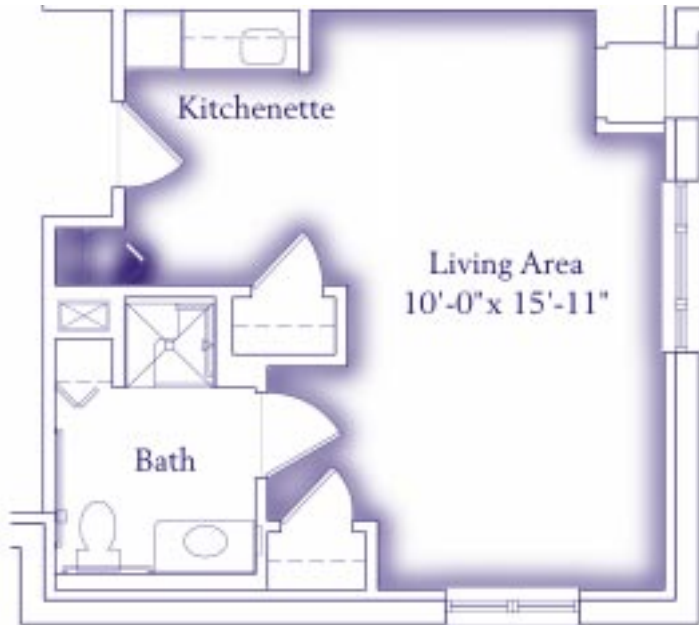
Studio Floor Plan* (approximately 400 square feet)

The apartment features a spacious living area, ample closet space, a large bathroom and kitchenette.